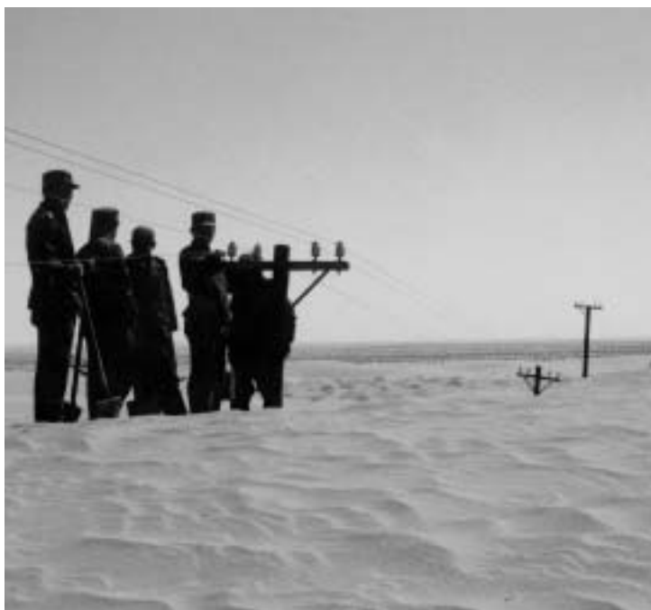
After sand storms, electricity and telephone poles are often buried in the drifting sand dunes. In order to keep systems working, soldiers have to raise the lines by extending the pole.

of Africa. Algeria, in particular, is being squeezed between the Mediterranean Sea and the Sahara Desert as the latter advances northward. In a desperate effort to halt this encroachment, Algeria has decided to convert the southernmost 20 percent of its grainland to perennial crops, such as olive orchards or grape vineyards, that will hold the soil better. Whether this will halt the advancing desert remains to be seen. At a minimum, it will be a difficult sacrifice in a country that already imports 40 percent of its grain. 22