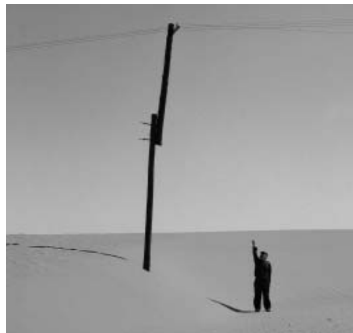
After more sand storms, the accumulating sand is carried to another location, leaving the extended pole far above the lowered land surface.

of Africa. Algeria, in particular, is being squeezed between the Mediterranean Sea and the Sahara Desert as the latter advances northward. In a desperate effort to halt this encroachment, Algeria has decided to convert the southernmost 20 percent of its grainland to perennial crops, such as olive orchards or grape vineyards, that will hold the soil better. Whether this will halt the advancing desert remains to be seen. At a minimum, it will be a difficult sacrifice in a country that already imports 40 percent of its grain. 22